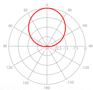
V/H - Port Pattern Azimuth 5.6 GHz