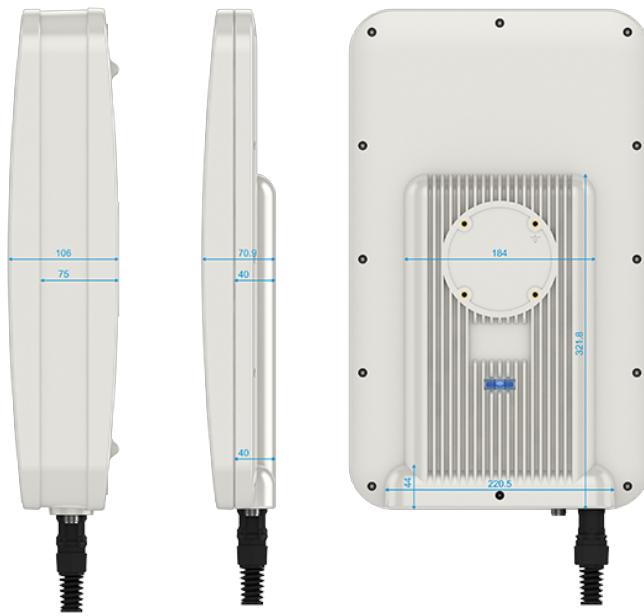
Outer dimensions WiBOX Extra Large Slim