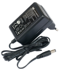
24 V 1.2 A power adapter