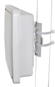
Vertical Mast Mount