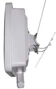
Horizontal Mast Mount