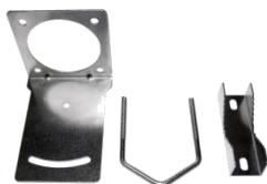
Antenna Adjustable L-Mounting kits

For further details: 4F-1 No. 106, Rueiguang Rd., Neihu District, Taipei City, Taiwan http://www.alfa.com.tw Email: sales@alfa.com.tw Tel:+886-2-27968477 Fax:+886-2-27968478