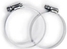
Mast O-ring Kits