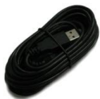
8M USB Cable