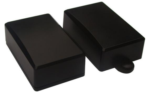
i3 Robust MiniBeacon