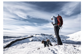
PETS, FARM ANIMALS