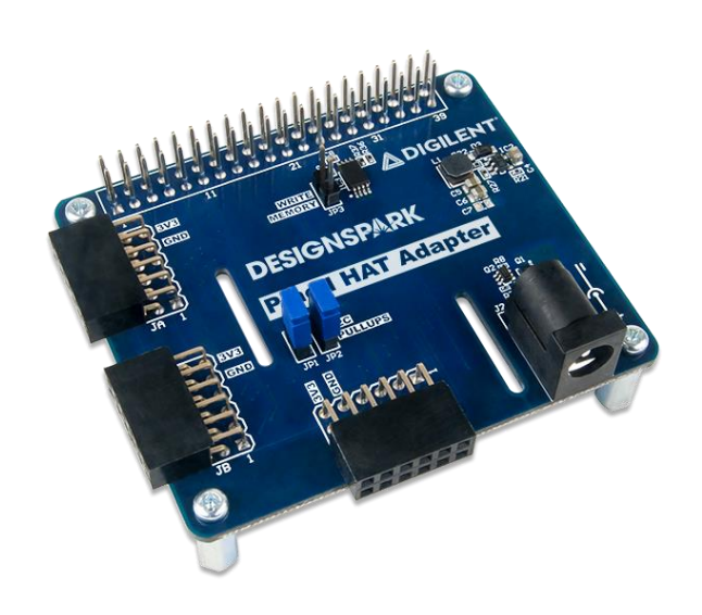
The Pmod HAT Adapter RS Stock No 1448419

The Pmod HAT Adapter makes it easy to connect Digilent Pmods to a Raspberry Pi. It supports plug-and-play functionality, only requiring that the host Raspberry Pi be booted with the Pmod HAT attached. The Pmod HAT has three 2×6 Digilent Pmod ports and provides access to additional I/O available via the Raspberry Pi 40-pin GPIO connector. The Pmod HAT Adapter comes with example Python libraries hosted on DesignSpark. See the Software Support section below for more information.