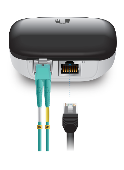
Connect an Ethernet cable carrying data and PoE.