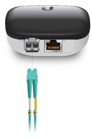
Connect a fiber optic cable. (UFiber ODN cable, model UOC-5 shown)