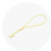
2x plastic straps