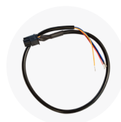
0.35m 4pin Automotive adapter cable