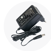
24V 0.8 A Power adapter